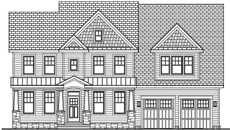
OPTIONAL SINGLE DOOR & SIDE ENTRY GARAGE AVAILABLE